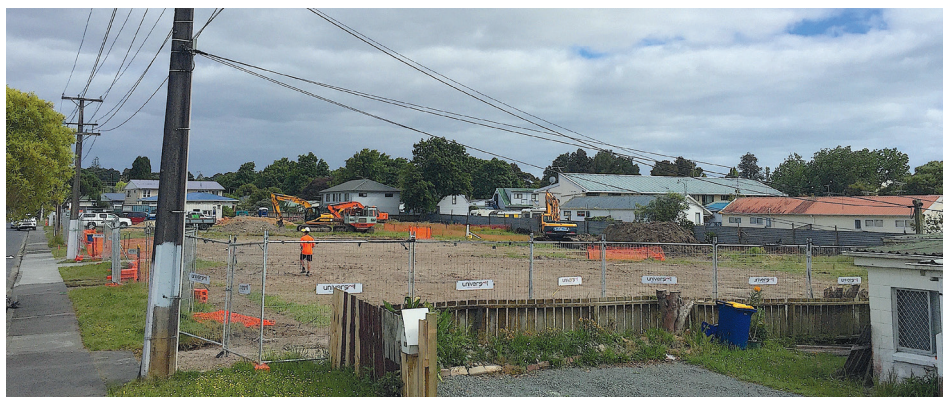
Work is underway on Tonar Street.