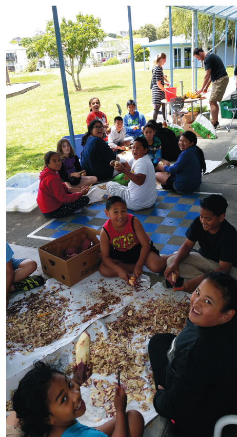
Students peel kumara for the hangi.

Some members of the community have expressed concern about the school’s future. The school is well supported by the community and the Northcote Development will bring more families to the area which will boost the roll. There are no plans to close the school, in fact the future for Onepoto’s schools looks bright.