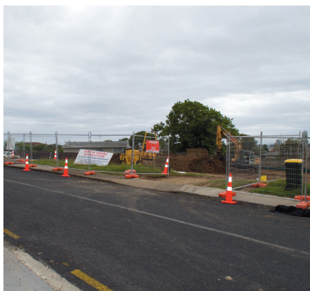
Demolition work at Potter Avenue site.

By using Housing New Zealand owned land more efficiently, we can add to the number of social housing units available. For example, in Tonar Street, Cadness Street and Potter Avenue the 20 units that have already been removed will be replaced with 59 new homes for families who need housing assistance.