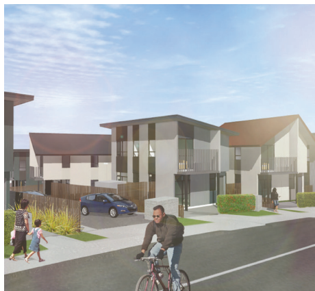
New Social Housing in Potter Avenue.

With the cost of housing rising in Auckland we have a greater need than ever for social housing to provide for people who need housing assistance.