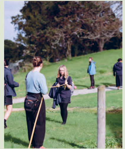
Above Northcote College greenway group students at work.

The schools' edge portion of the greenway has the potential to become a 'local learning landscape', a place for students to learn in an outdoor classroom setting as well as a place for the wider community to share cultural skills, local stories and knowledge about local ecology. “We're focusing on how spaces within the greenway might work as places for fun learning, and in turn, we are learning from the students about what's important and exciting to them.”