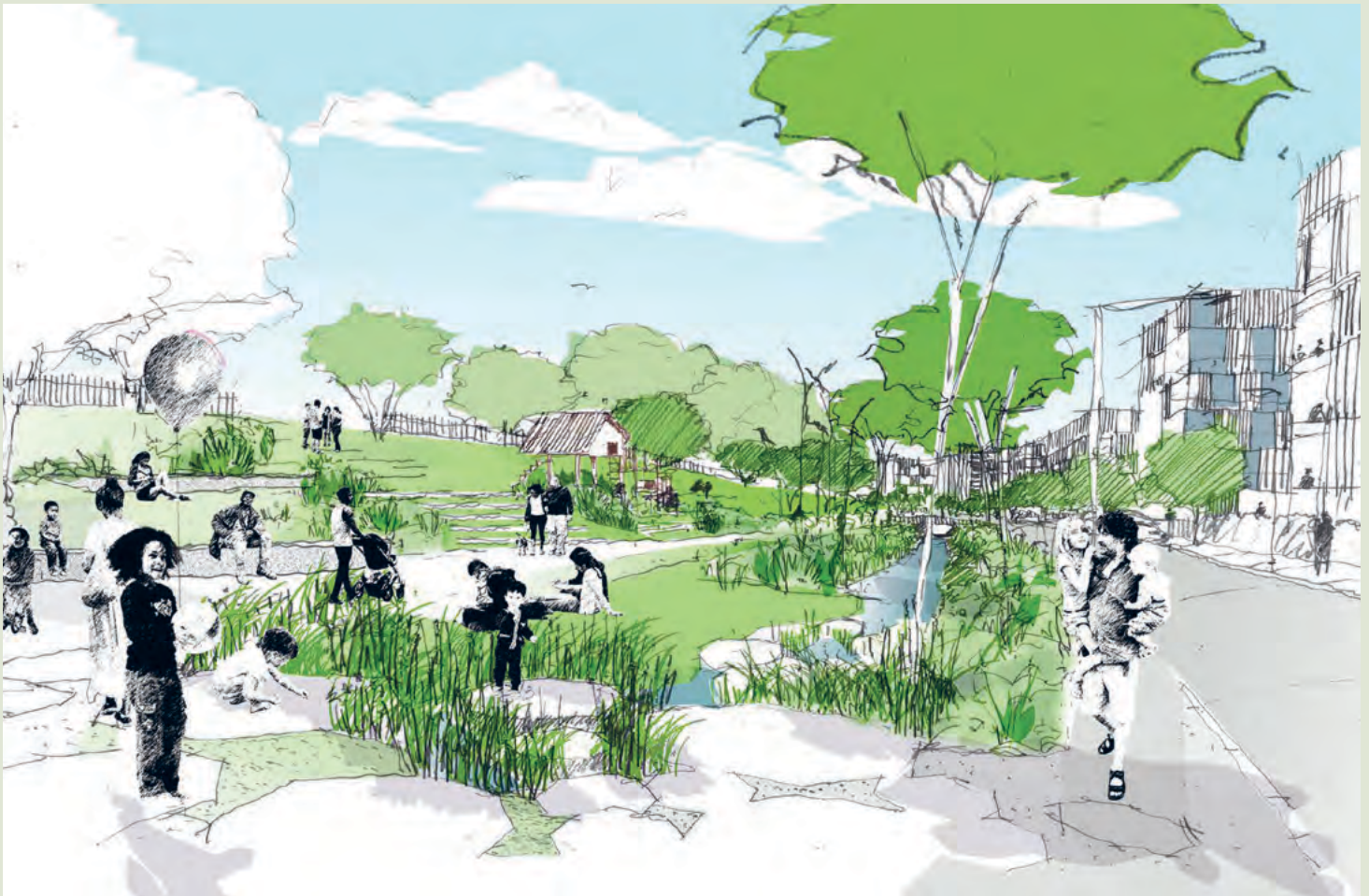
Below An artist's impression of the greenway bordering the Northcote Intermediate grounds.