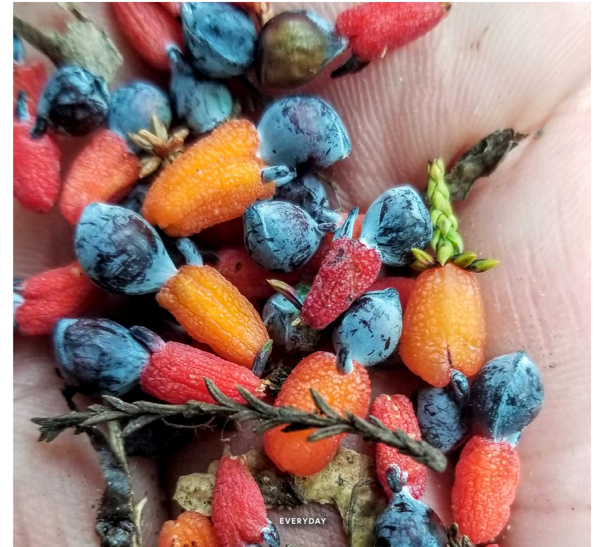
Below Berries from the kahikatea, NZ's tallest endemic tree