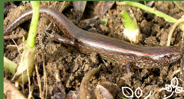
Above Copper skink