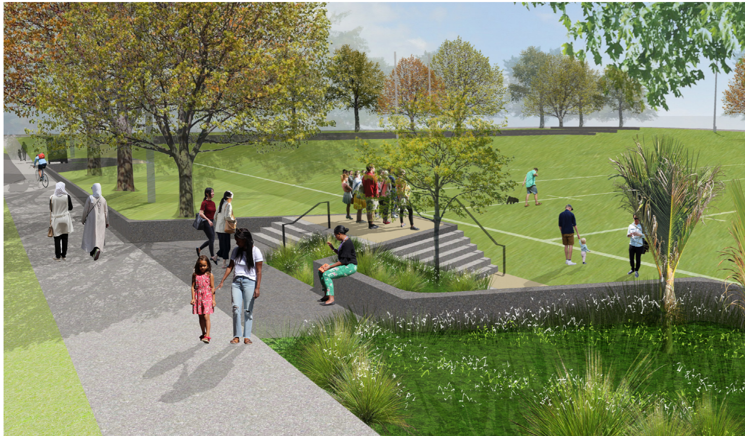
Above Looking over the reserve from the proposed flood wall at the Lake Road entrance.