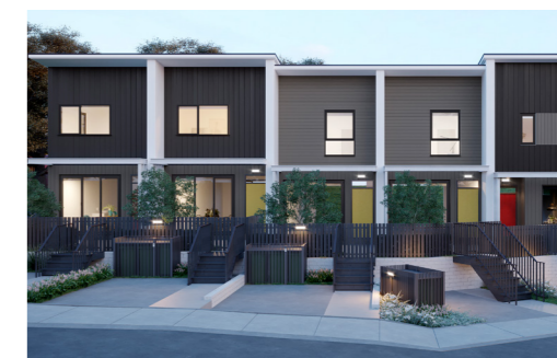
Above Universal Homes' Northcote development