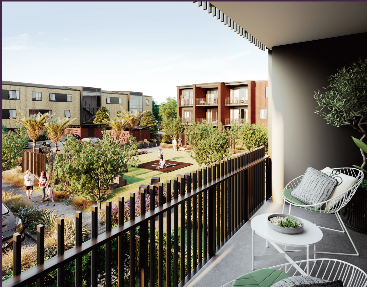
Above The Fraser Avenue apartments are scheduled for completion in late July with residents moving in August