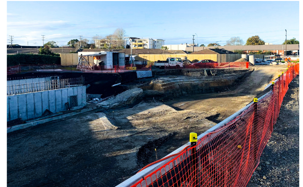
Above Digging and foundation works on the reserve's wetlands area is almost complete

Auckland Council Healthy Waters department is enhancing Greenslade Reserve and improving the stormwater network. You will have seen that work is well underway and so far, they have started digging up what will be the wetland. You will have also heard the hydrovac, which has been used to expose underground pipelines and connections. It has been quite loud, so a big shout out to the local community who have been dealing with noise – thank you for your patience.