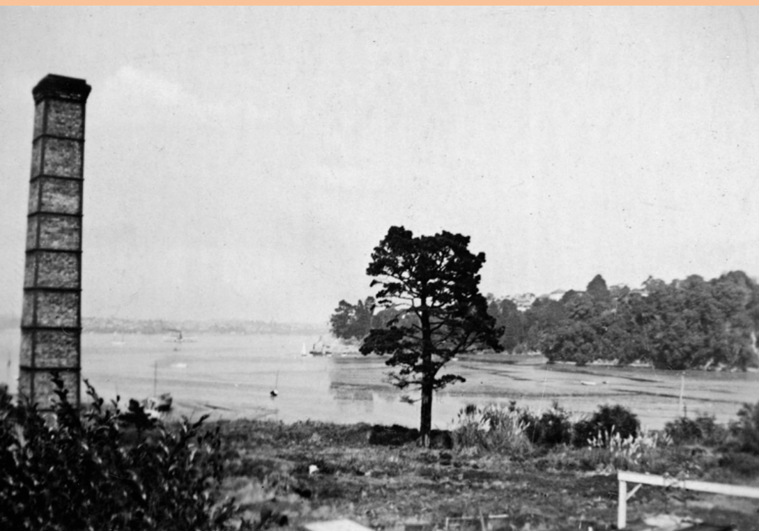
Below Gasworks, Northcote c1920s