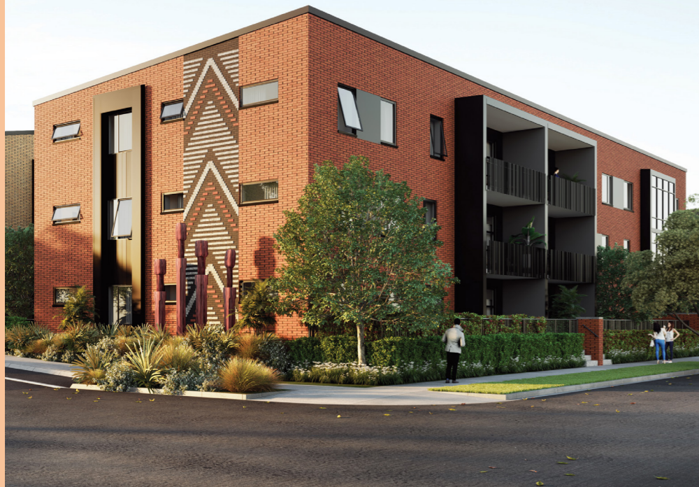
Above Artist impression of NZ Living's Fraser Avenue apartments