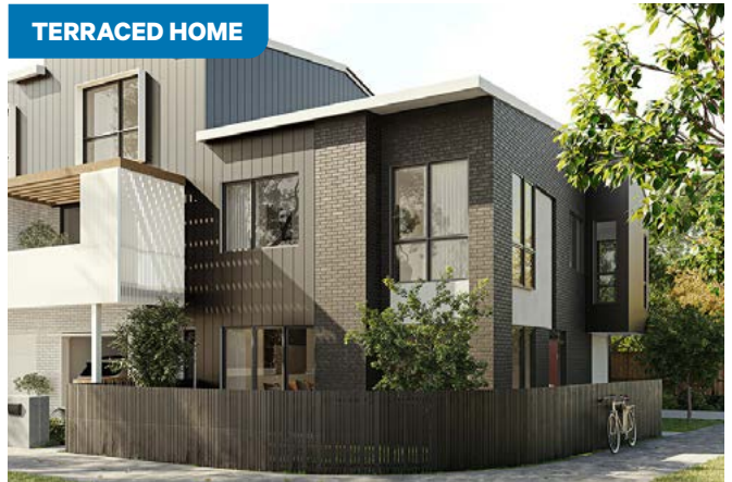
LOT 6 - 98 CADNESS STREET