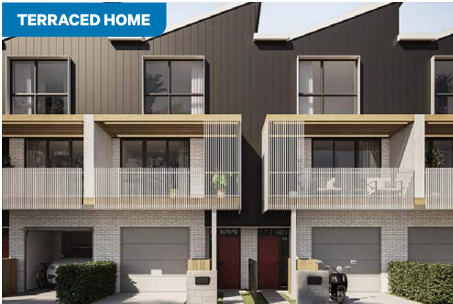
LOT 2 - 9 MOWAI ROAD