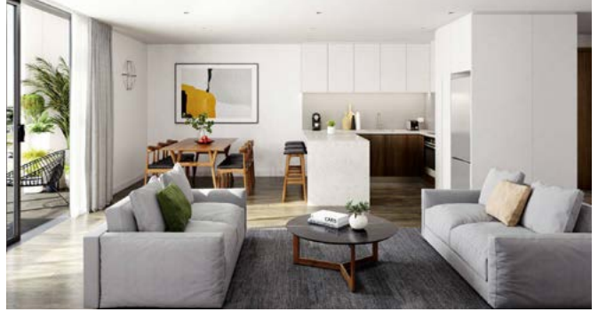
APT 210 / 223 LAKE ROAD