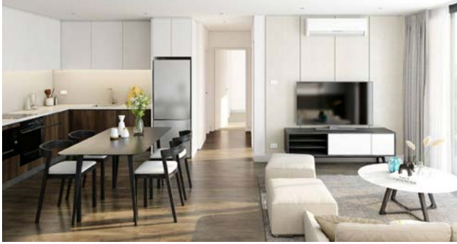
APT G02 / 223 LAKE ROAD