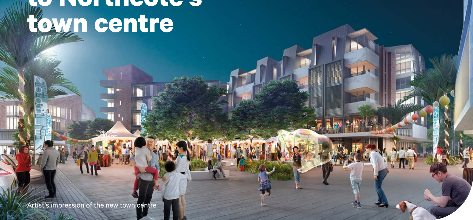
Artist's impression of the new town centre