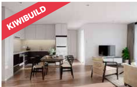
412/223 LAKE ROAD