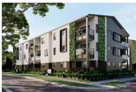
APT 34 - 203/63 TONAR STREET