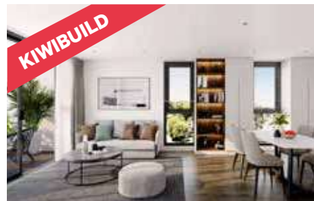
104/223 LAKE ROAD