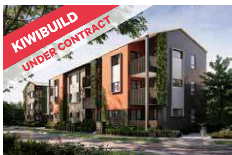
102/100 CADNESS STREET