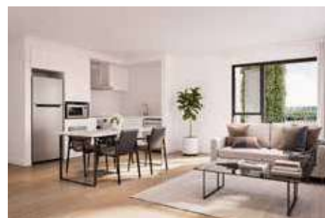
APT 33 - 202/63 TONAR STREET