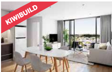
501/223 LAKE ROAD