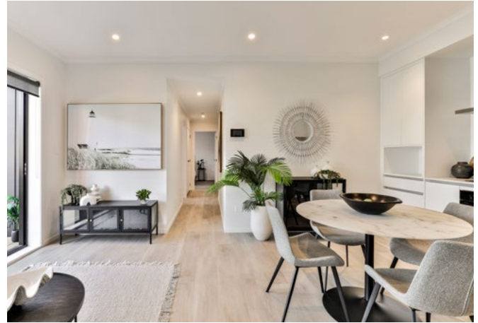
102/3 TIAKINA ROAD