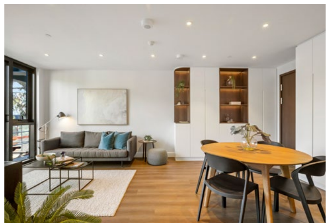
308/223 LAKE ROAD