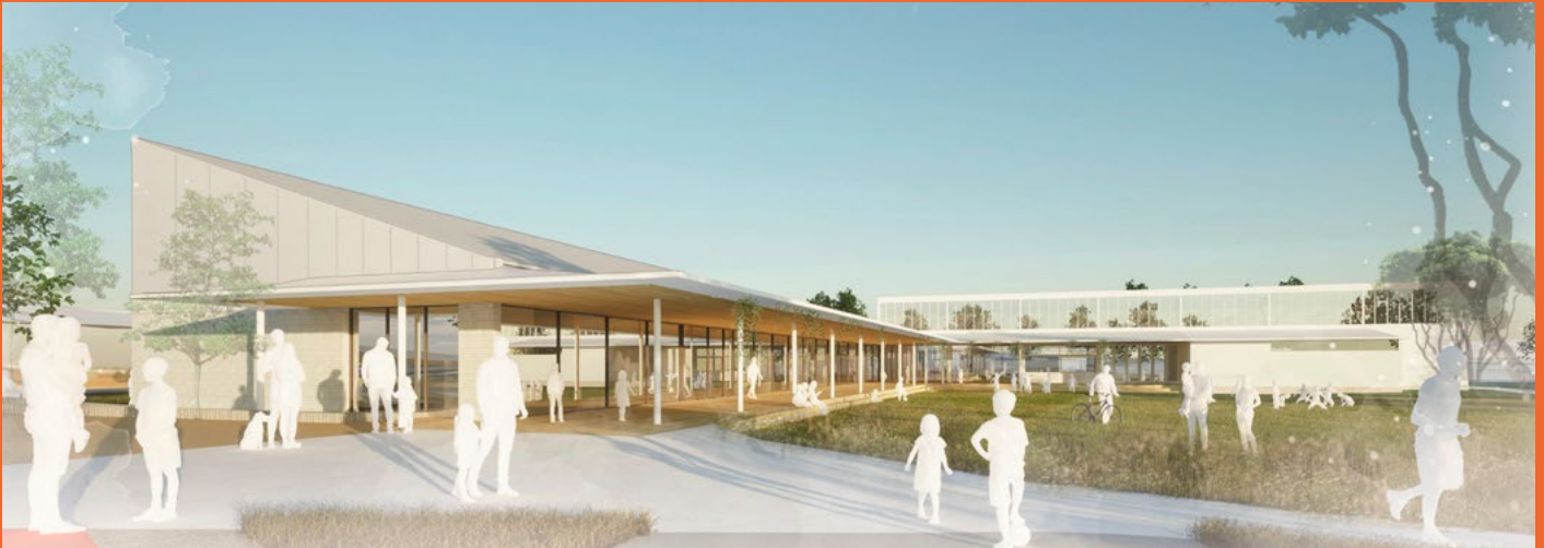
Artist's impression - back of the new community hub and the upgraded Puāwai Cadness Reserve, which is part of Te Ara Awataha – Northcote's new greenway.

We're redeveloping the town centre, on behalf of Auckland Council, to create a more thriving heart for Northcote. A key project is the construction of a new community hub.