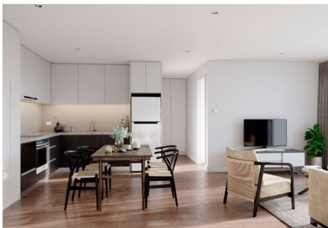
301/223 LAKE ROAD