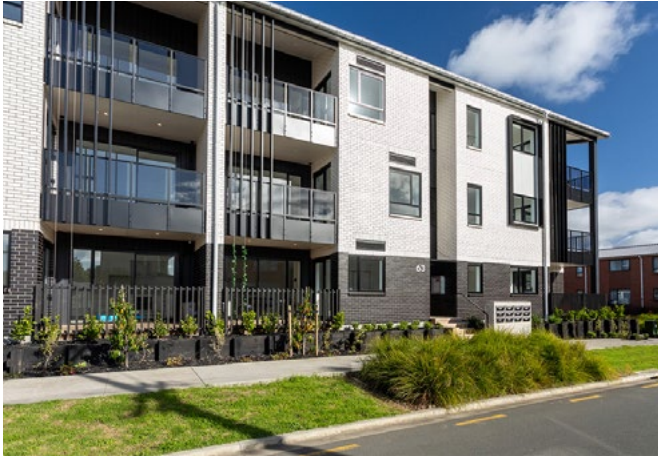
203/63 TONAR STREET

With its parks, proximity to great beaches and ongoing development — Northcote is a suburb worth investing in. If you like the sound of a brand-new, cleverly-designed home, head to northcotedevelopment.co.nz/for-sale/ to find out more. For more information about any of these properties, contact our build partners directly.