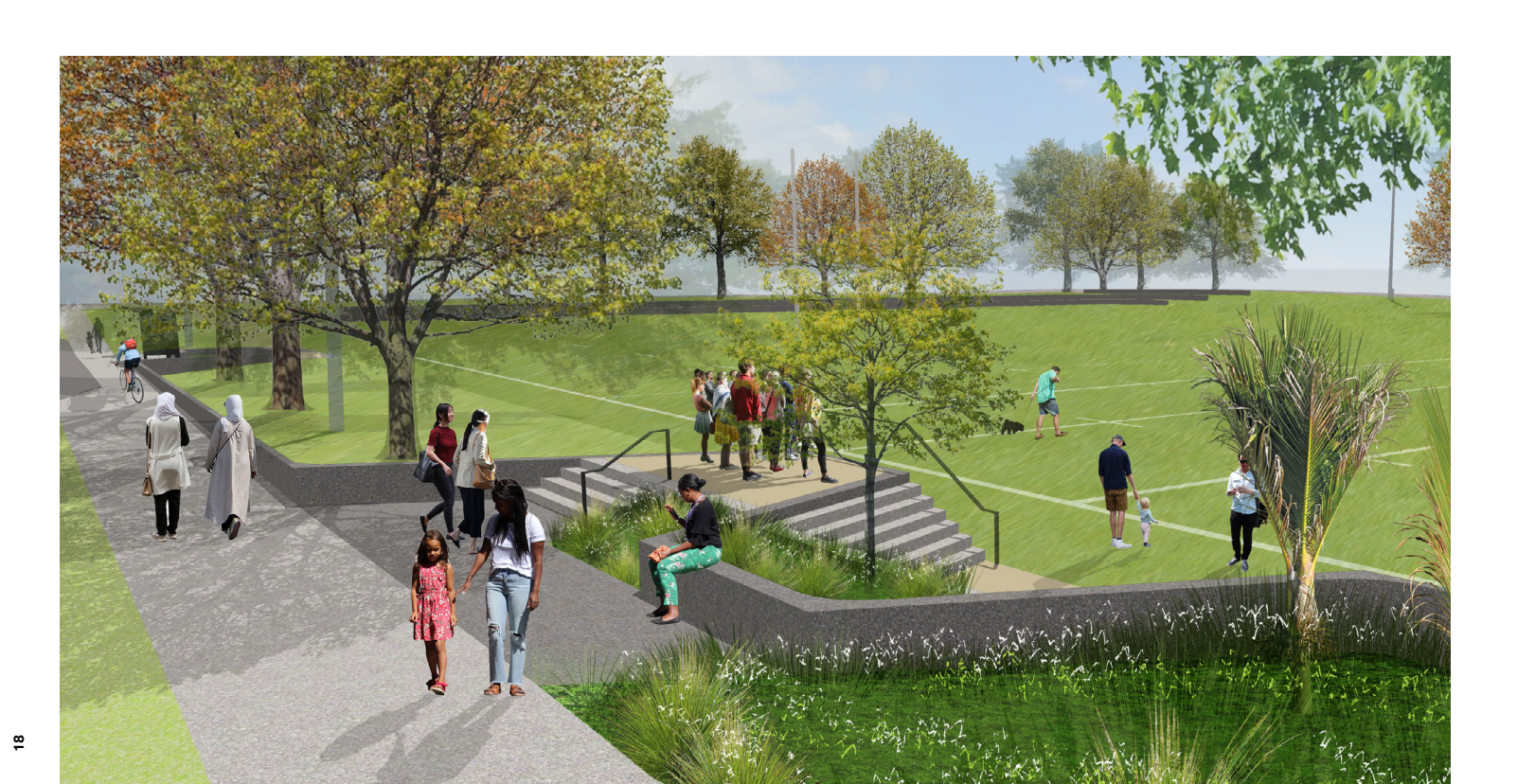
Above Looking over the reserve from the proposed flood wall at the Lake Road entrance.