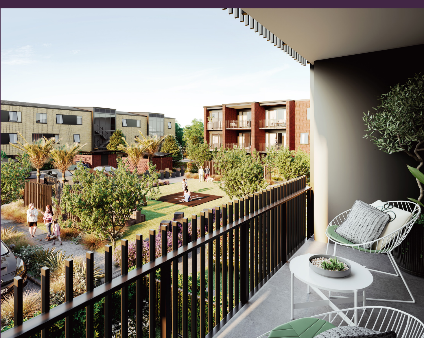
Above The Fraser Avenue apartments are scheduled for completion in late July with residents moving in August