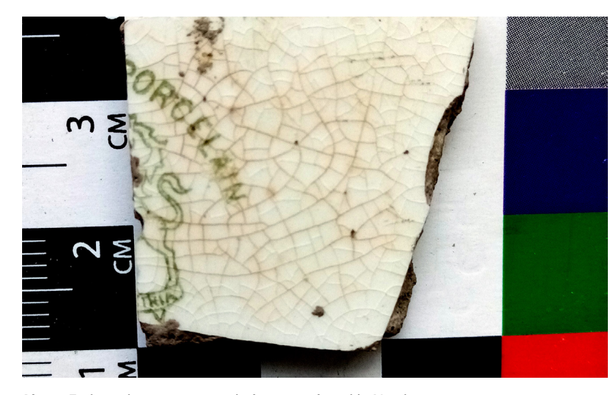
Above Early 20th century ceramic fragment found in Northcote

"We know that a Māori community lived in the area, but we have very little information on how they lived. It's one of the many hidden histories of early Auckland," he says. "While we have plenty of information about the big businessmen and their families, the communities on the edge of the city, especially Māori and Chinese, are largely 'silent'."