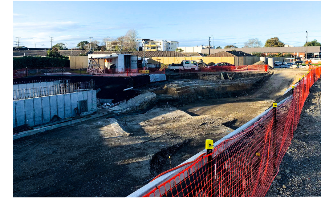
Above Digging and foundation works on the reserve's wetlands area is almost complete

Auckland Council Healthy Waters department is enhancing Greenslade Reserve and improving the stormwater network. You will have seen that work is well underway and so far, they have started digging up what will be the wetland. You will have also heard the hydrovac, which has been used to expose underground pipelines and connections. It has been quite loud, so a big shout out to the local community who have been dealing with noise - thank you for your patience.